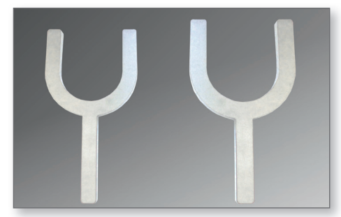
Service tool adjusting aid for HV-plugs R24 and R28/R30

If you did not receive the notification by e-mail, please contact our service or sales department.