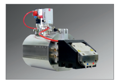
Microfocus X-ray tube XWT-300-CT

The increasing interest of industrial customers in high resolution X-ray testing of dense and complex parts led to the development and introduction of the innovative 300 kV microfocus X-ray tubes XWT-300-CT and XWT-300-THE Plus in 2014 and 2015.