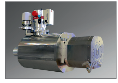
Microfocus X-ray tube XWT-300-THE Plus