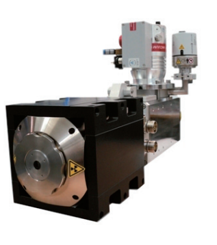
XWT-100-TCHR with cooling of the tube head

The Development Center for X-ray Technology (EZRT), a cooperative department of the Fraunhofer Institutes for Integrated Circuits IIS (Erlangen) and Non-destructive Testing IZFP (Saarbruecken and Dresden) has installed the new high resolution X-ray tube XWT-100-TCHR supplied by X-RAY WorX.