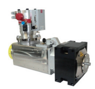
Rod anode tube XWT-160-RA-30-15-P4HE

Especially for applications in semiconductor industry X-RAY WorX developed the High Energy rod anode tube with transmission target for up to 25 Watt target power. The rod anode allows the placement of the X-ray source directly on the examined component. This leads to extreme magnification of the details under inspection.